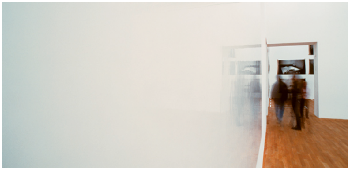
Wandstück 3-teilig (Wallpiece, 3 parts). 1993/96. Polished wall paint, each part 9.8 x 13.8 ft.

Karin Sander: Exactly. The questions are clearly defined, but in coming to grips with the situation you encounter, the questions and also the type of answers you are looking for begin to change, and in the end something emerges that you had not previously envisaged. This is precisely what motivates you to do anything in the first place. If I could see in advance how a project is going to end, I'd have absolutely no desire to carry it out. The realisation, or the result, must surprise me too.