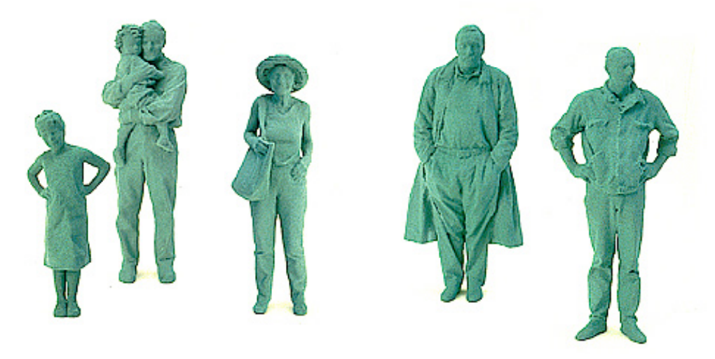
1:7,7... Unlimited, 2001. ART' 32 Basel. Plaster material, pigment (chromium-oxide-hydrate green)

Karin Sander: Not entirely so. People cannot expect to understand a language that they have never spoken before, though they must at least be prepared to understand. Of course, you have to assuage their fears and let them know that they don't have to be that well informed. But they must take the trouble to look. Incidentally, one way of helping them to understand is to combine works so that certain relationships become clear – for instance by placing early and later works by the same artist side-by-side, or works by different artists dealing with the same problem. Such contexts can make art more accessible.