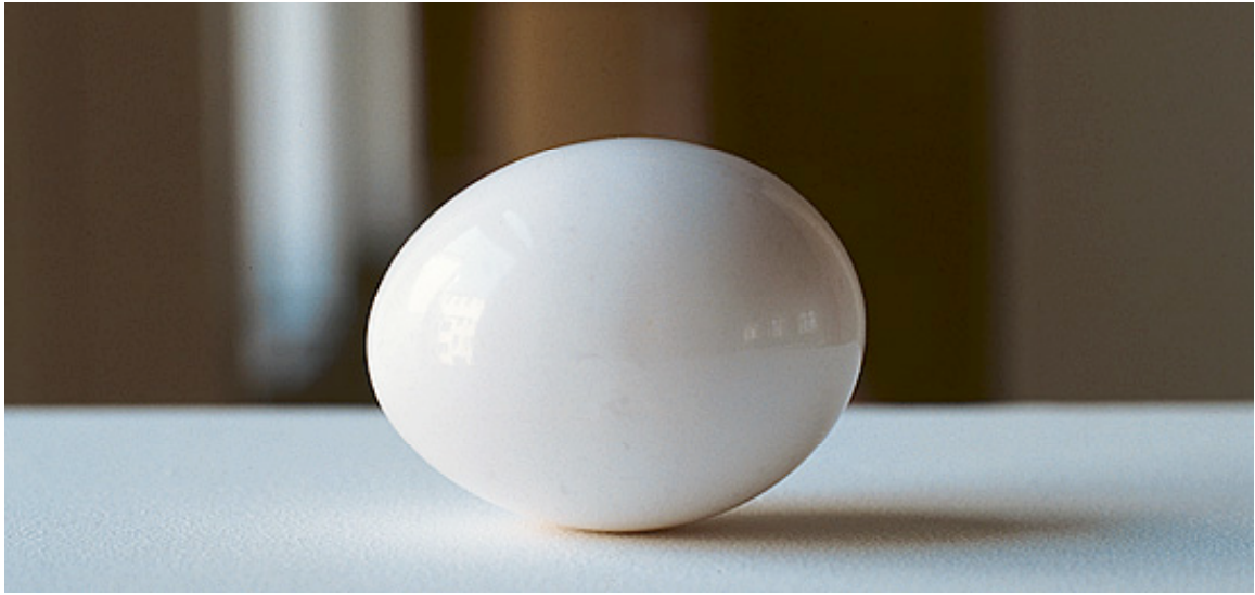
Chicken's Egg, Polished, Raw, Size 0, 1994. "Leiblicher Logos – Vierzehn Künstlerinnen aus Deutschland", an exhibition organised by the Institut für Auslandsbeziehungen, Stuttgart Sammlung/Collection Staatsgalerie Stuttgart

Would it be correct to say that you yourself achieve these insights as you carry out the work in question?